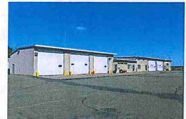
Town Hall & Fire Department