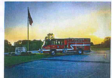
Somerset Fire Rescue